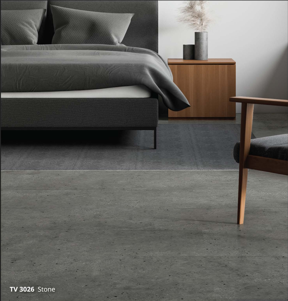
TV 3026 Stone