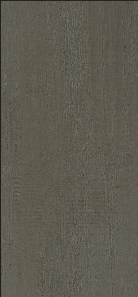
TV 3033 Gray Sand