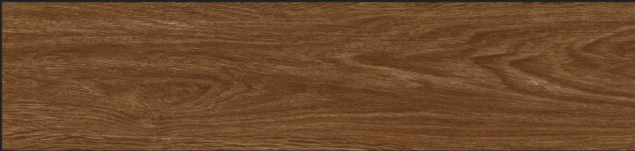
TV 3051 Truffle Oak NEW