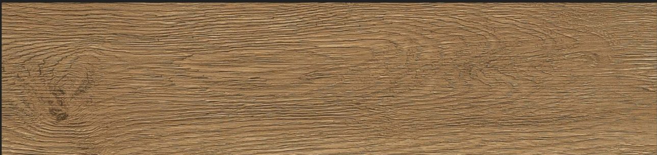
TV 3005 Vintage Oak