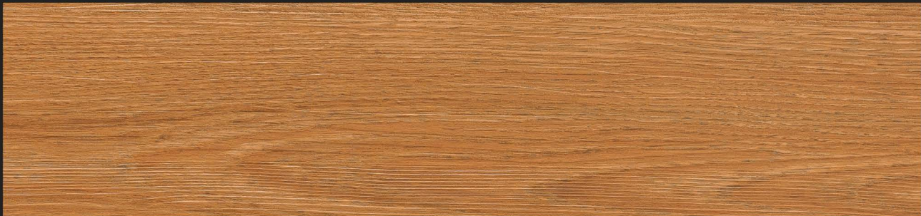
TV 3004 Parma Oak