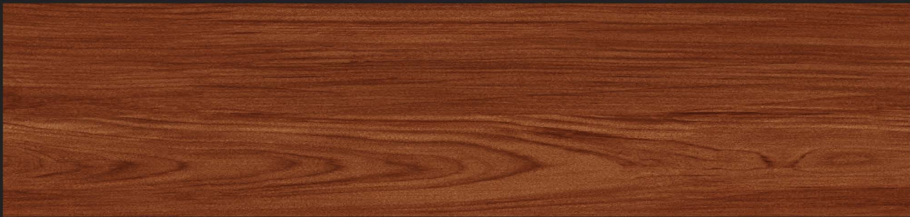
TV 3050 Crimson Oak NEW