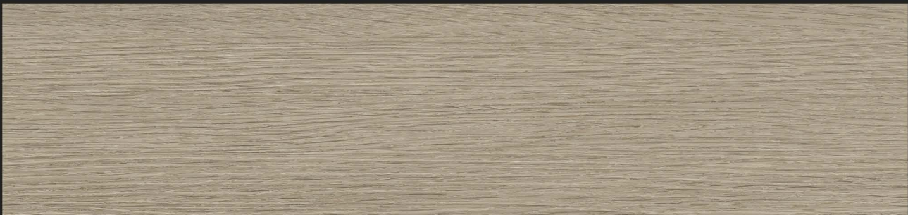
TV 3003 Washed Oak