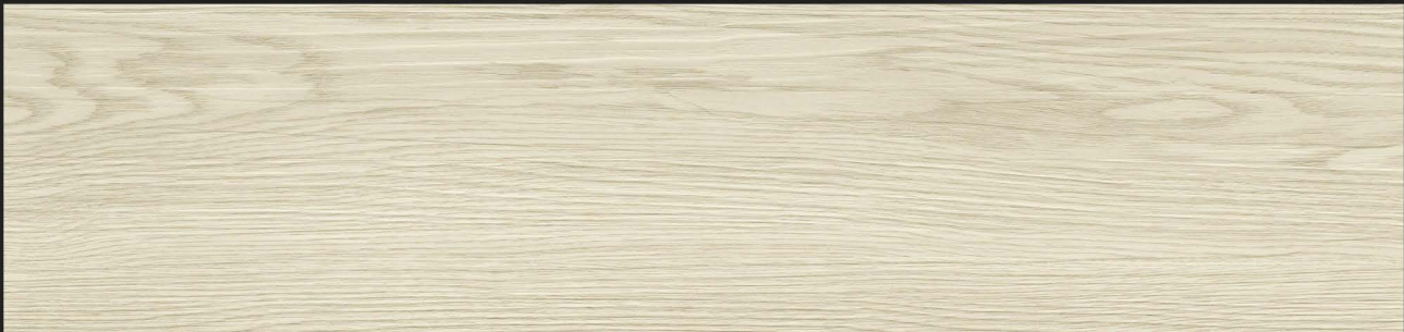
TV 3013 White Oak