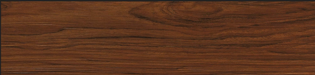
TV 3007 Merbau Wood