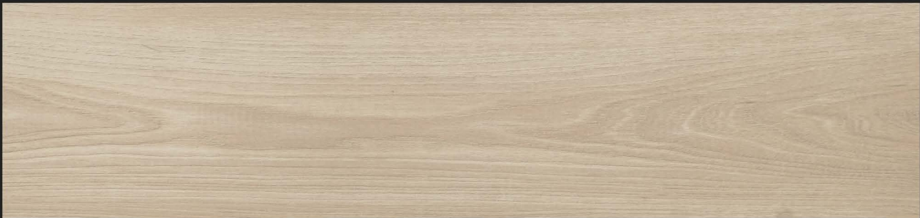
TV 3029 Summer Teak