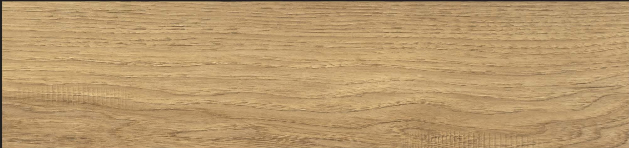
TV 3047 Sierra Oak