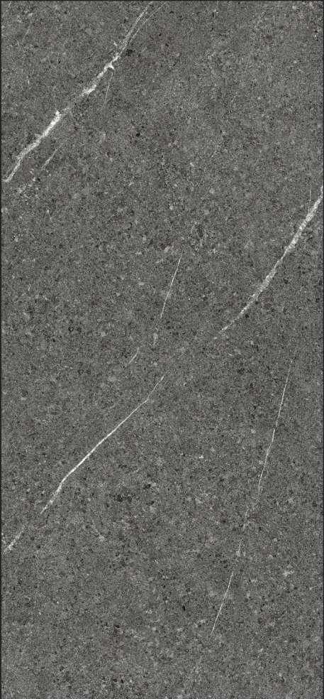
TV 3052 Urban Slate NEW