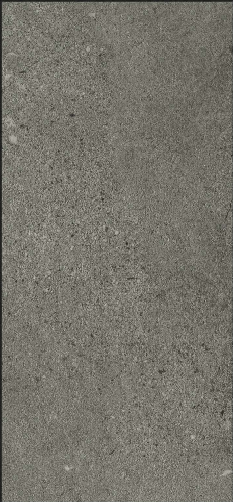
TV 3026 Stone