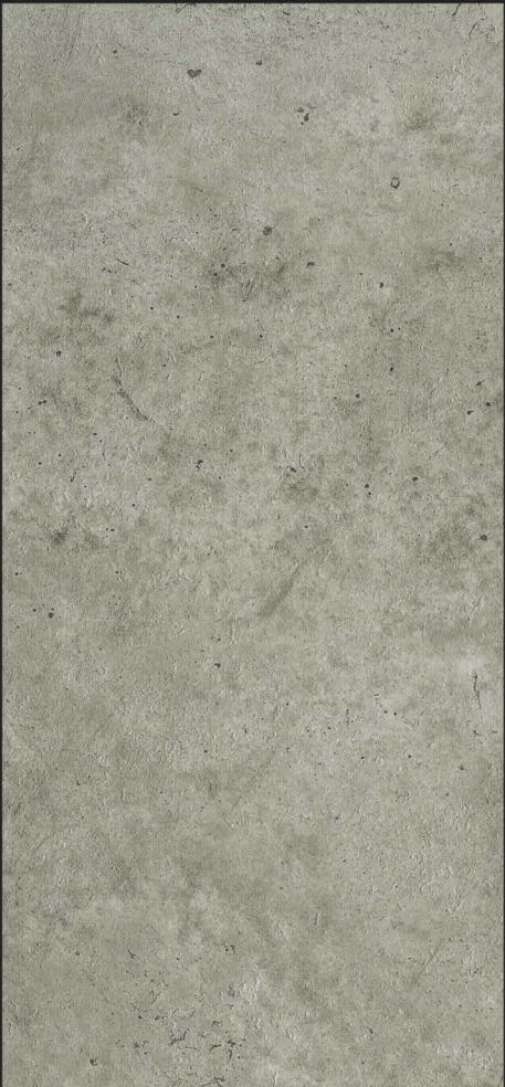
TV 3024 Grey Slate