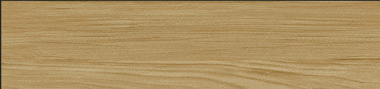
TV 3049 Golden Ash NEW