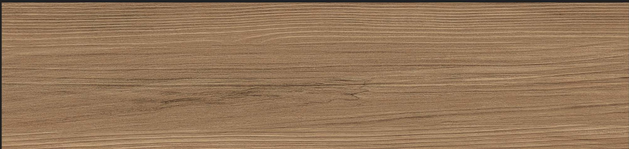
TV 3008 Sand Malmo