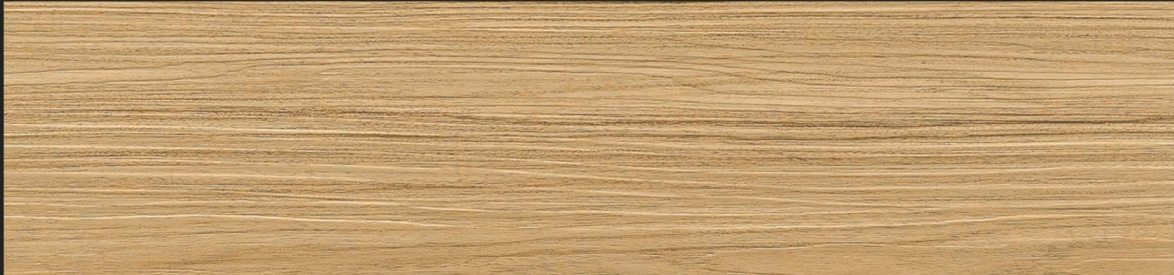
TV 3015 Vicenza Elm