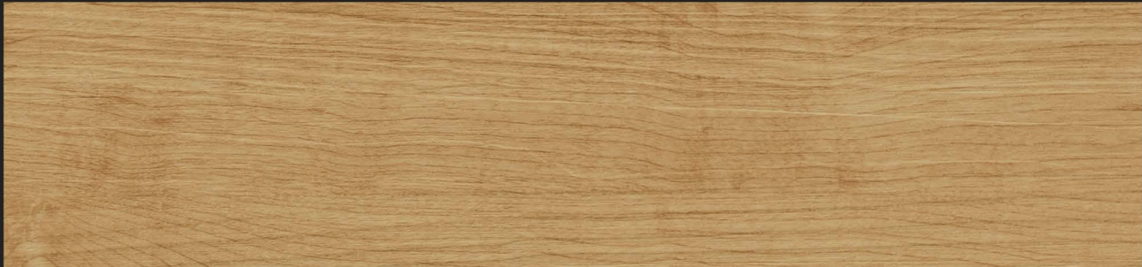
TV 3010 Warm Cherry