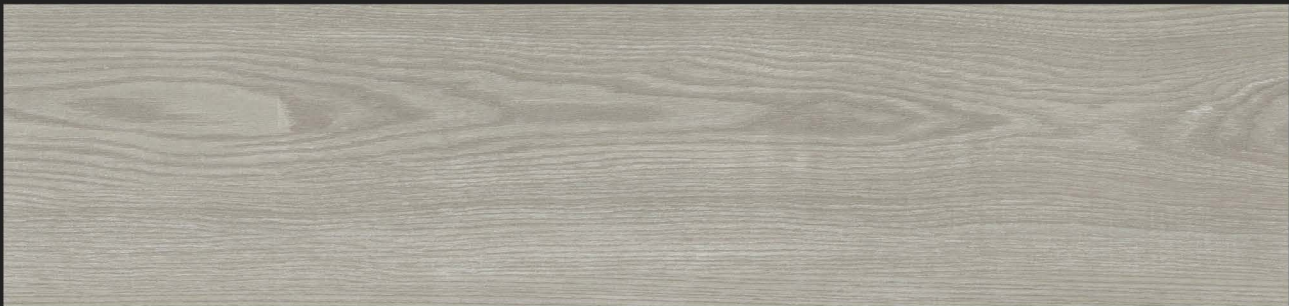
TV 3031 Charleston Teak