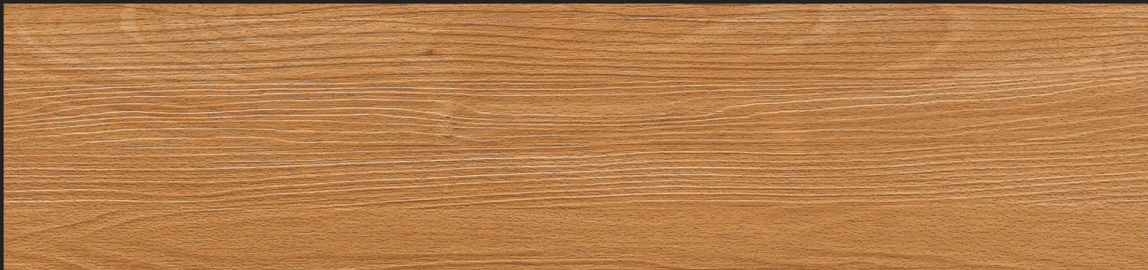
TV 3014 Natural Beech