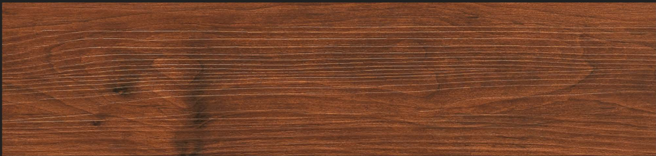
TV 3017 Original Cherry