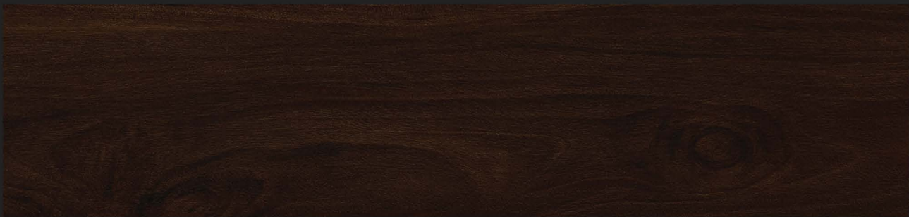
TV 3021 Scottish Applewood